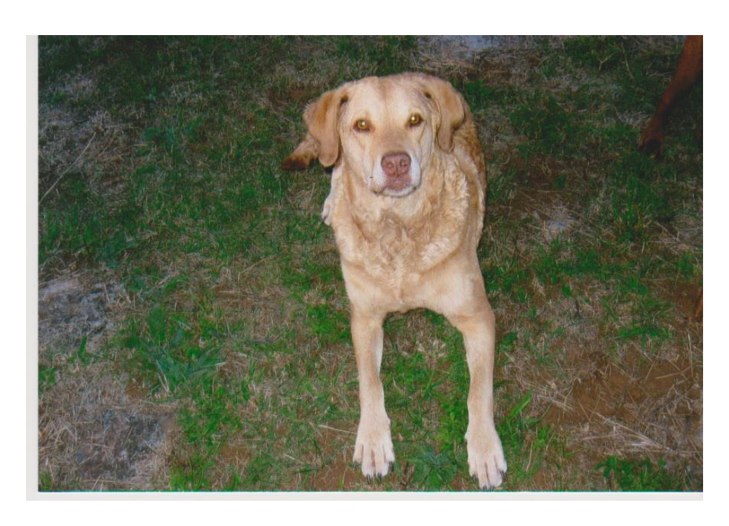
February 17, 2004 to January 21, 2013