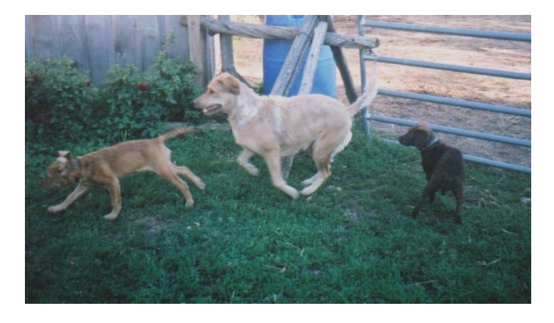
another precious gift; walking in the woods together, always together.