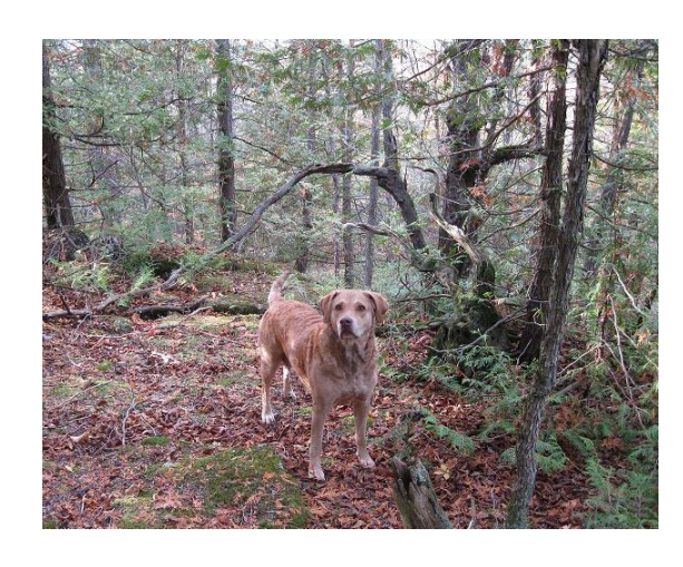
In faith the knowledge that death is a beginning. I Cor 15:35 to 44