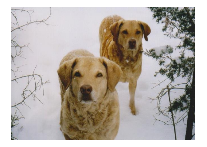
In faith comfort for our broken hearts. In faith His presence with us always.